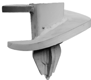
Super Heavy Duty Hub Anchors

Power-Grip Heavy Duty Hub Anchors are higher torque rated hub anchors used primarily in higher capacity applications. Available in Heavy Duty are, 2-1/2" and 2-1/4", with 4 flight sizes (8", 10", 12" and 14"). Power-Grip Heavy Duty Hub Anchors are made from structural steel tubing and sheet steel with the 3/8" steel flights formed to a 3" pitch for consistent penetration. Used in combination with Power-Grip Hub Anchor Rods and Eye-Nuts. Power-Grip Heavy Duty Anchors come painted for rust resistance.