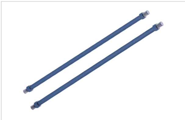
Hub Anchors Rods

Power-Grip Hub Anchor Rods are steel rods that utilize two forged and threaded ends to connect Power-Grip Hub Anchors (1-3/8", 1-1/2", HD, and SHD) to the surface. Available in 2 lengths (3-1/2' and 7') and 3 different nominal rod sizes (5/8", 3/4", and 1"). Power-Grip Hub Anchor rods are used in combination with Power-Grip Hub Anchors, Power-Grip Heavy Duty Hub Anchors, Power-Grip Super Heavy Duty Hub Anchors, and Eye-Nuts and are galvanized to ASTM A123 standards. Note the thread size of the Power-Grip Hub Anchor Rod must match the thread size in the mating Power-Grip Hub Anchor.