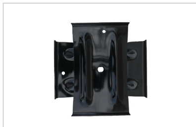
Cross Plate Anchors