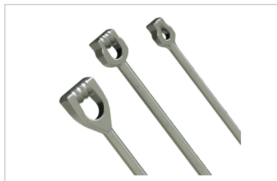
Forged Anchor Rods