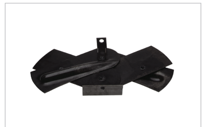
Pole Key Anchors